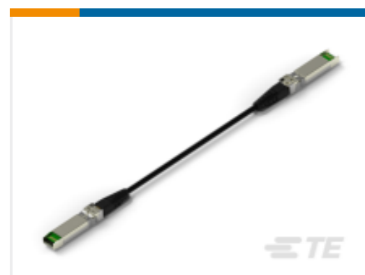
TE Part # 4-2821222-5 SFP56 DIRECT ATTACH CA, 2M, 30AWG