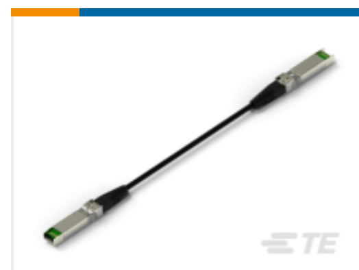
TE Part # 4-2821224-5 SFP56 DIRECT ATTACH CA, 3M, 26AWG