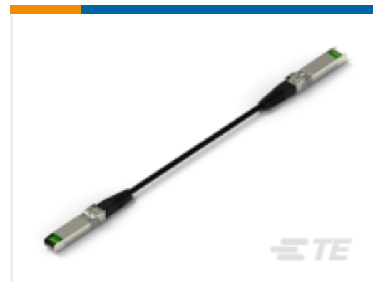
TE Part # CAT-C11-N4901114 SFP28 to SFP28 Cable Assembly: 30 AWG