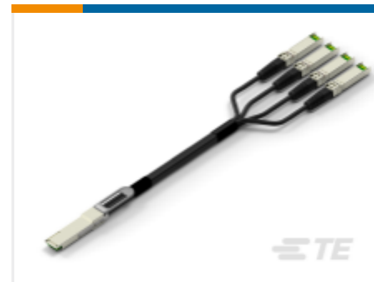
TE Part # CAT-C11-N490333 QSFP28-Four SFP+ Cable Assembly: 30 AWG