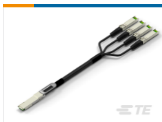
TE Part # CAT-Q17-N490333 QSFP56-Four SFP56 Cable Assembly: 26 AWG