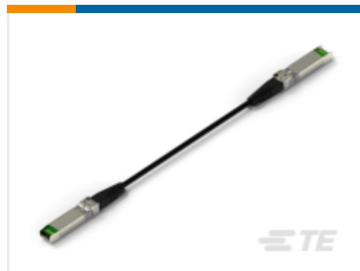
TE Part # 2334985-2 SFP28 DIRECT ATTACH CA, 1M, 32AWG