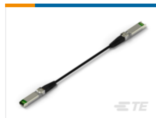
TE Part # 4-2334985-2 SFP56 DIRECT ATTACH CA, 1M, 32AWG